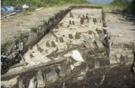
Llangorse crannog: Burnt oak palisade timbers in foreground with encircling post settings in lines to shore edge.

anatomy of the crannog mound and its construction, and the material culture found. The process of underwater survey and excavation identified a complex sequence of crannog construction and expansion.